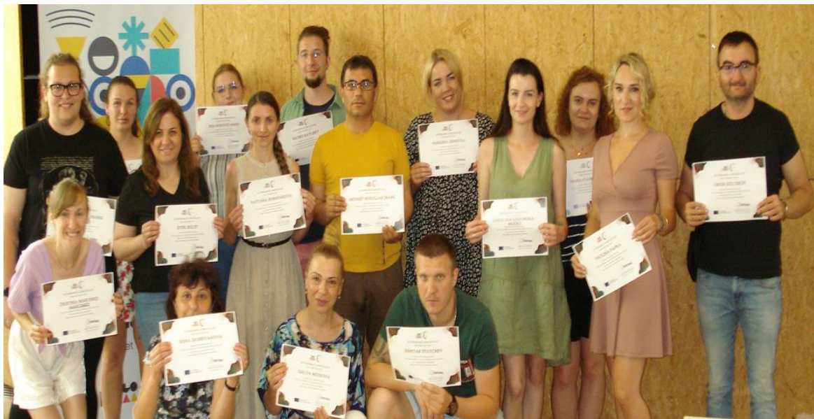
Project partners in Valencia, 2022

Collecting Data Methodology: Research (Internet sources, interviews)